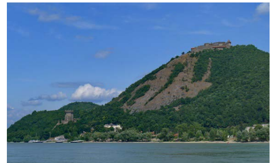
Upper and lower fortification castles in Visegrad