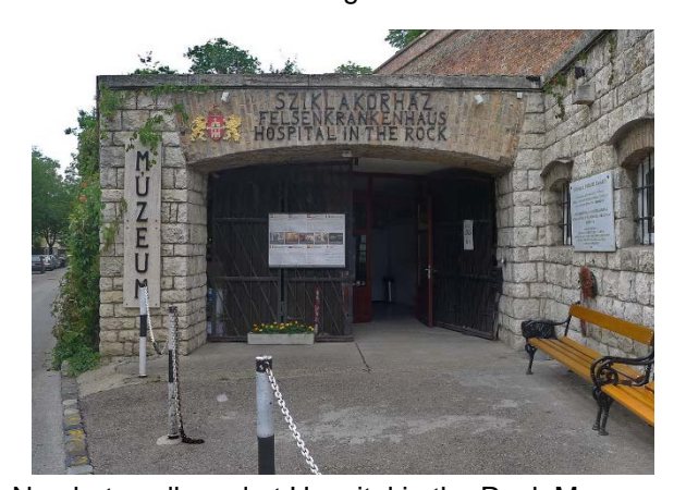
No photos allowed at Hospital in the Rock Museum