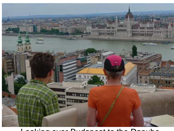
Looking over Budapest to the Danube