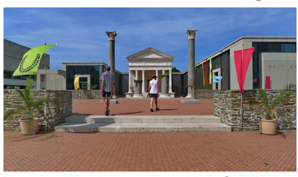
Walking through the Iseum Savariense Museum at a re-built temple to Isis in Szombathely