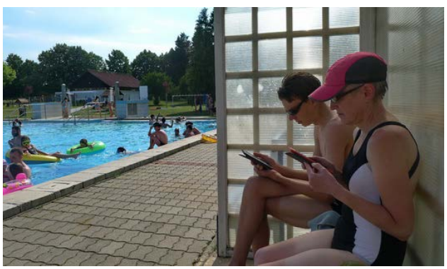
Reading in the shade at Thermal Camping Sarvar