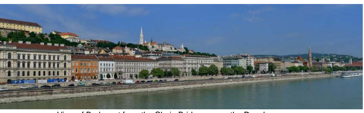
View of Budapest from the Chain Bridge across the Danube