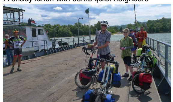
We had to ferry across the Danube several times