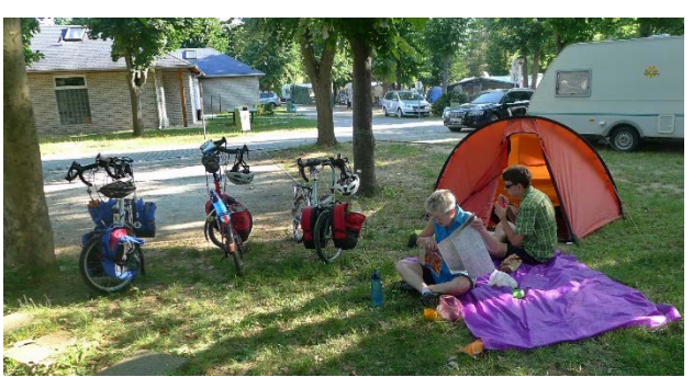
Our neat site at Thermal Camping near Buk