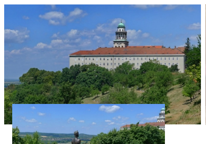
Pannonhalma Archabbey has a working farm growing dozens of herbs and lavender for soaps and oils