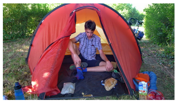
Our home away from home