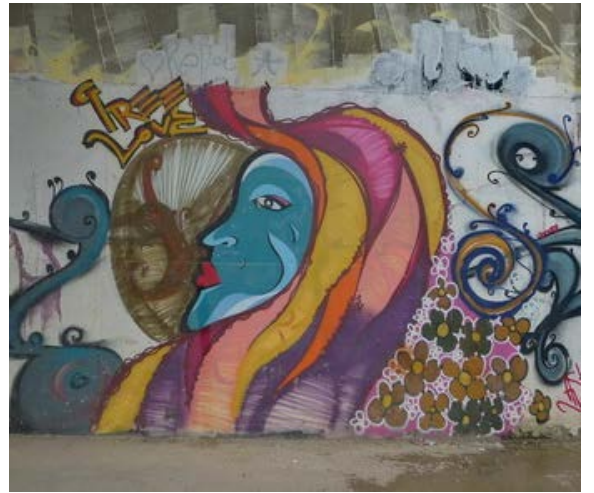
Graffiti at a bicycle underpass