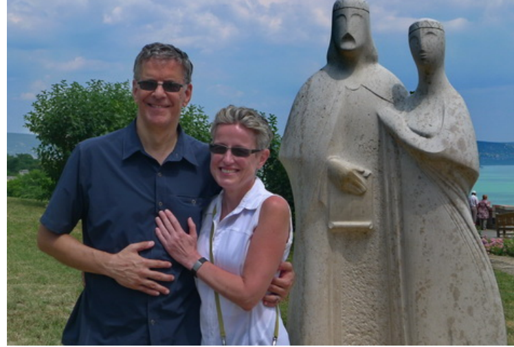
Living and stone statues in Tihany