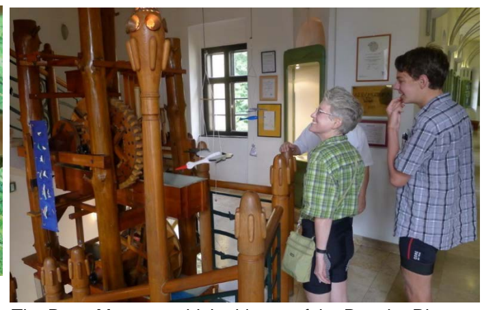
The Duna Muzeum told the history of the Danube River