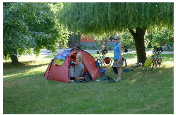
Empty campground at Zalaszanto