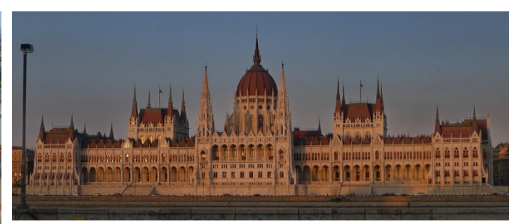
The Parliament Building on the Danube

Leaving the triple bike home for the first time, this trip found us touring through Hungary on our new Bike Friday folding bikes. The roads were generally rough, but almost no roadside trash or broken glass. The heat was impressive, pegged in the 90's for most of the trip, which might have put a damper on our feelings. Thank goodness for all of the swimming pools!