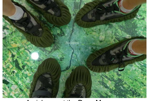
Aerial map at the Duna Muzeum