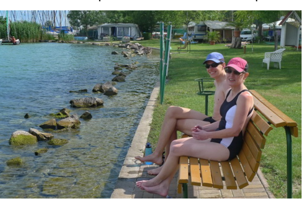
After a dip in Lake Balaton