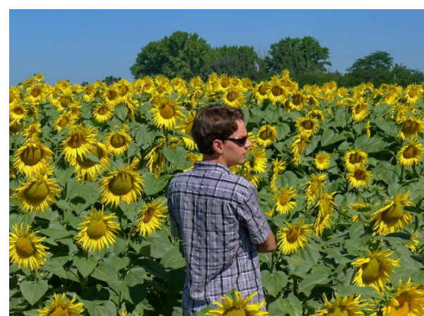
Who doesn't like to stand in a field of sunflowers?