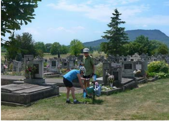
Cemeteries were our go-to spot for water