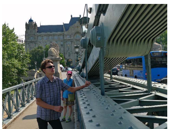
Crossing the Chain Bridge