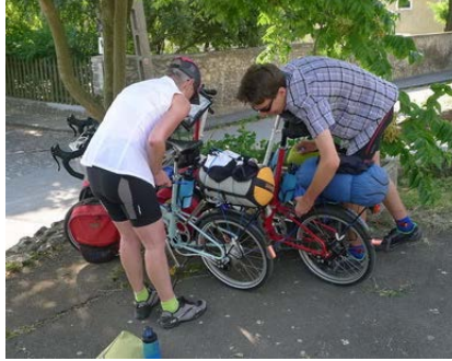
Locking the bikes at Sumeg Castle