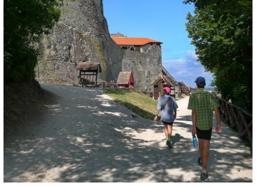
The upper castle in Visegrad