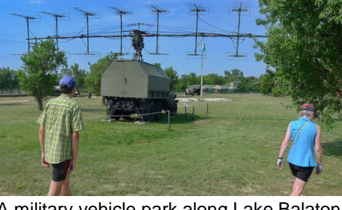
A military vehicle park along Lake Balaton