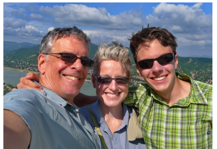
From the top of the upper castle in Visegrad