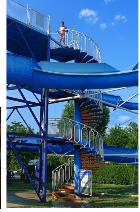
Lots of water slides in Hungary