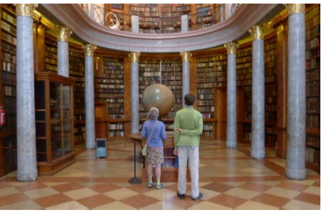
360,000 books at the Pannonhalma Archabbey library