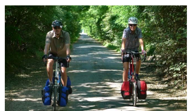
This paved road turned into a narrow foot path