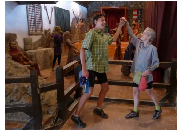
Dancing with mannequins at Visegrad castle