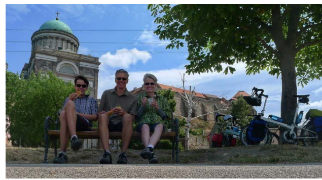
One last lunch along the Danube bike path