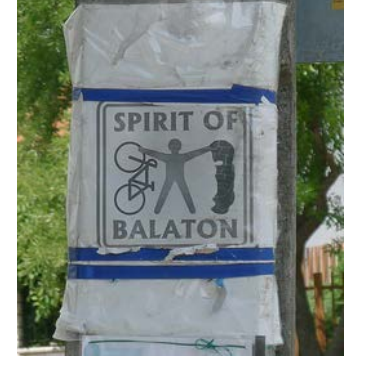
There is a well traveled bike path around Lake Balaton