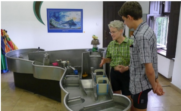
Exhibit showing hydrologic controls at Duna Muzeum