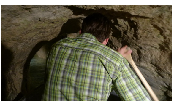
Paddling the underground river and 3D exhibits at the Lake Cave of Tapolca